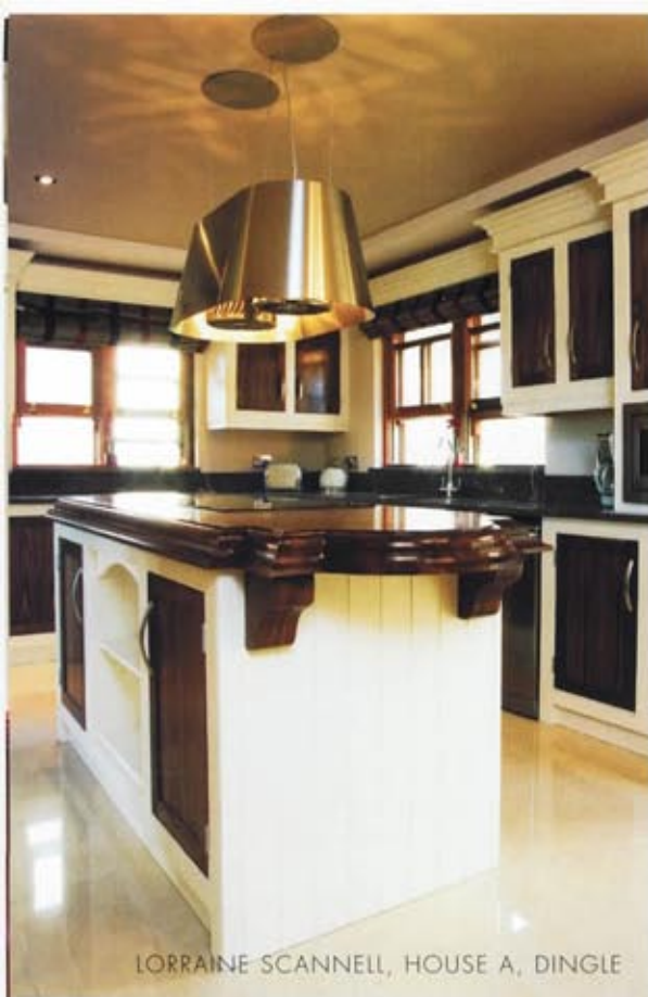
LORRAINE SCANNELL, HOUSE A, DINGLE