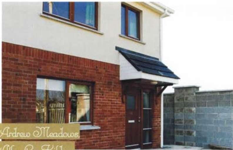
Andrew Meadows Athy, Co. Kildare

PROPERTY TYPE: Two, three and four bedroom houses and one and two bedroom apartments.